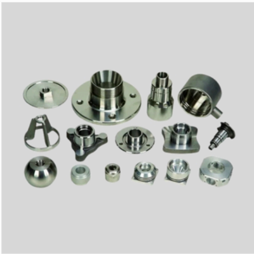
Machined Block Component