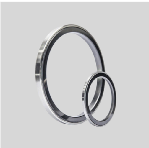
Metal Sealing Ring