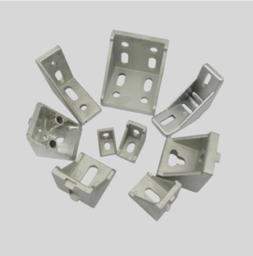
Aluminum Mounting Brackets