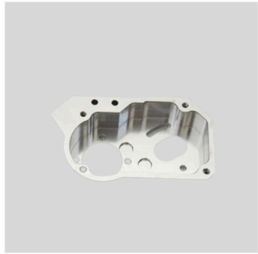
CNC Milled Housing