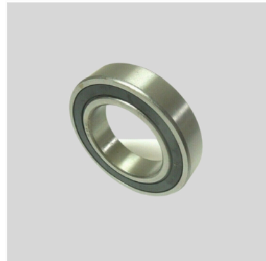
Bearing Housing Ring