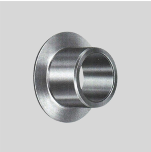
Metal Flanged Bushing