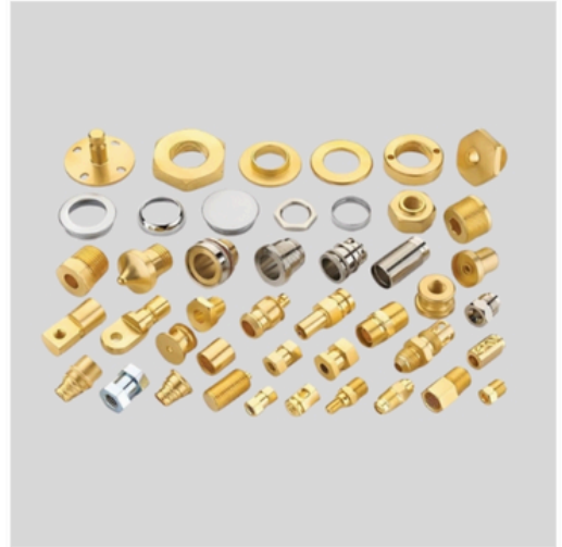
Precision Brass Fittings