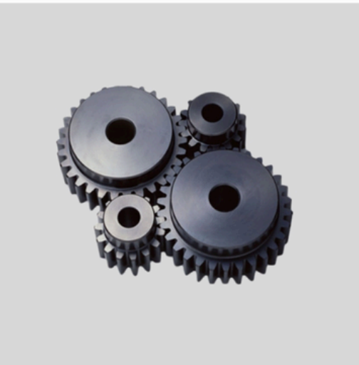
Industrial Spur Gear