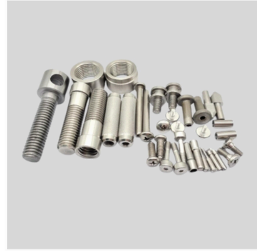
Threaded CNC Inserts