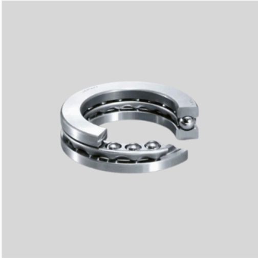
Thrust Bearing Ring