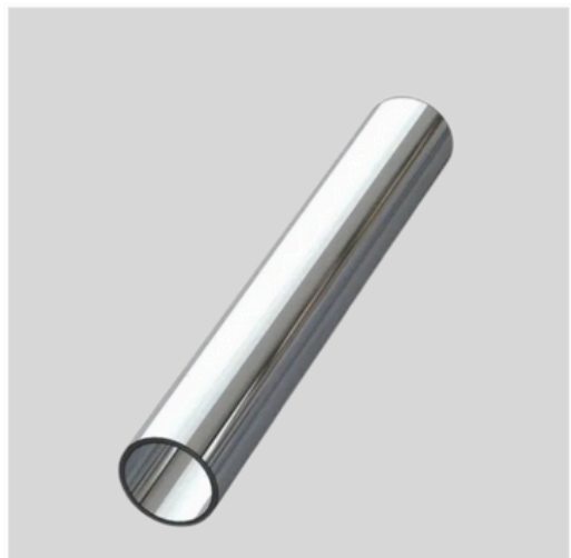
Steel Hollow Tube