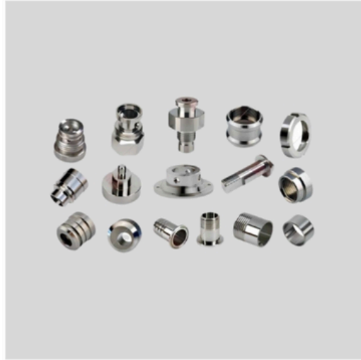
CNC Turned Components