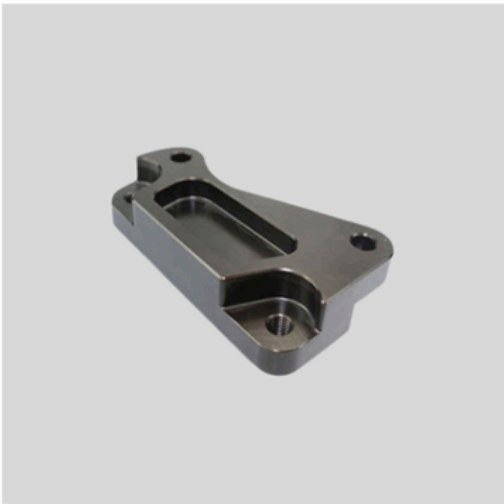
Custom Milled Bracket