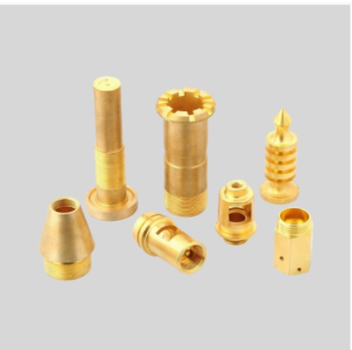
Brass Turned Part